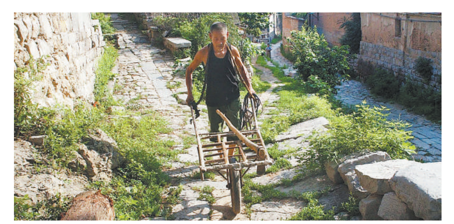
A villager pushes a wheelbarrow in Zhujiayu village, Shandong province.

Specifically in Shanghai, according to the "Shanghai Foreign Talent Position in Urgent Need Catalogue (Trial)", some professionals with certain majors can be exempted from the academic qualification verification.