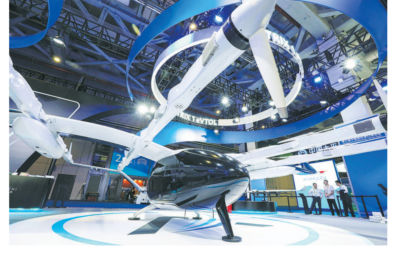
The Matrix 1 manned electric vertical take-off and landing vehicle developed by a Chinese company makes its debut at the sixth China International Import Expo held in Shanghai from November 5 to 10, 2023.