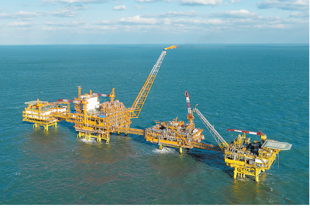
The Phase I project of Bozhong 19-6 Gasfield, the first 100 billion cubic meter gasfield in Bohai Sea, has been successfully put into operation, marking a new stage in the development of deep complex hydrocarbon reservoirs in China.

Eleven ministerial representatives attended GEO Week and nearly 1,000 representatives from the United States, the European Commission, South Africa, the GEO Secretariat as well as other GEO members, participating organizations and associates took part in the activities during the week.