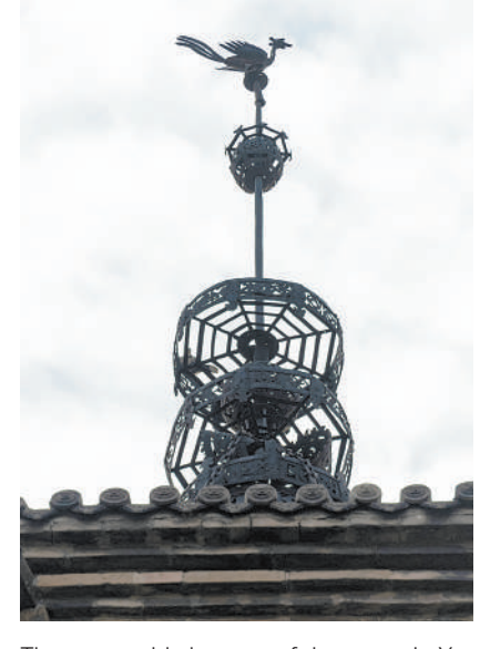
The copper bird on top of the tower in Yuanjue Temple in Shanxi province.

The weathercock invented in Europe in the 12th century is similar in principle to the copper bird, but replaces the shape of bird with a rooster. The rooster has a pointed beak, a small head and a large tail. When the wind blows, the direction indicated by its beak is that of the wind.