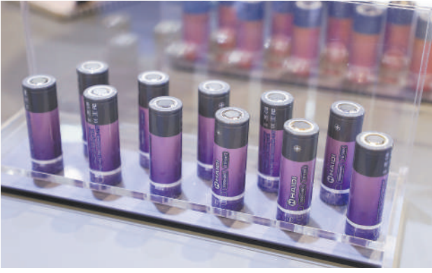
Energy storage can balance supply and demand.

Efficient energy storage is crucial for the green transition. One of the pri-