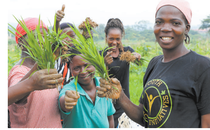
The locals show seedlings at the China-aided Nigeria Agricultural Demonstration Center in Abuja, Nigeria.

He illustrated the main areas where the two countries promoted science innovation cooperation, such as resuming the New Zealand- China Scientists Exchange Programme, signing memorandum (MoU) of cooperation arrangements with the Chinese Academy of Sciences, fund-