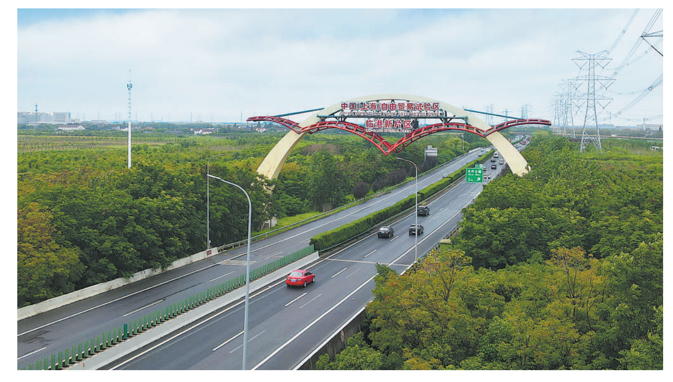
The China (Shanghai) Pilot Free Trade Zone.

Notably, it specifies the initiation of pilot programs to relax foreign investment access to sci-tech innovation. Eligible foreign-invested enterprises in pilot free trade zones such as Beijing, Shanghai and Guangdong are allowed to expand in areas like the development and application of genetic diagnosis and treatment technologies. It also supports opening-up measures in fields like information services (limited to app stores) to ensure better results in the pilot free trade zones.